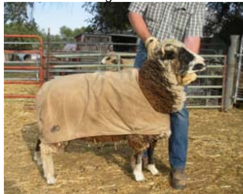
Good and snug; not too tight.