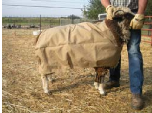
Too large and loose.

Rocky Sheep Suits come in two types of fabrics. There is a heavy nylon suit made from the material used in tough backpacks and other durable out door products.