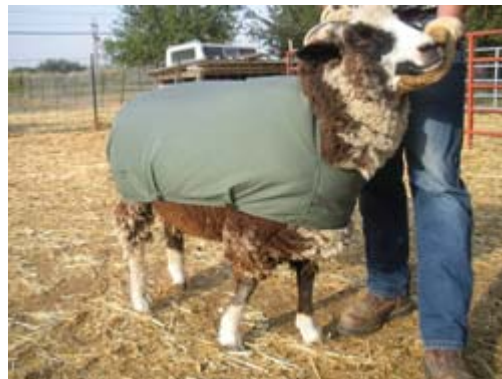
Too small (wool bulging, cover tight).

"It's about impossible to remove vegetable matter by hand," he said. "In a commercial operation it's not so much of a problem because they probably carbonize the vegetable matter with a mild acid."